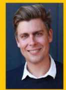
Tobias Merz Counter Tenor