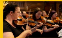
4MBS Classic FM 103.7