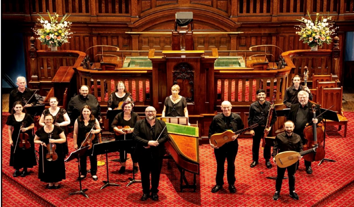
Queensland Baroque Orchestra