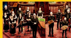
Queensland Baroque Orchestra